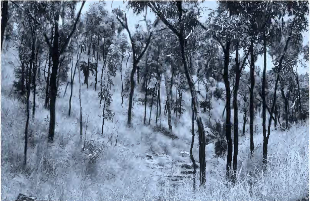
Fig. 6. Habitat of Cycas cupida .